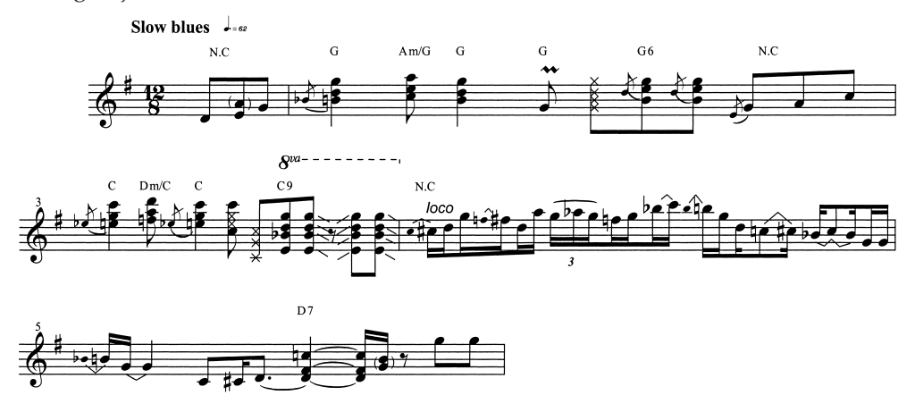
Example 5. 'Texas Flood' (Davis, Larry/Scott, Joseph W.) © 1958 Duchess Music Corp./Universal/MCA Music Ltd. Used by permission.

Example 6, extract from 'The Same Way' by Peter Green (from the LP, John Mayall, A Hard Road , Decca, 1967, my transcription) shows a segment of one of British guitarist Peter Green's typical blues lines. The tune is clearly based in A-major tonality, with 'shuffle'-comping rhythm guitar typical of a blues/rock style. Introducing the solo is an E (dominant) chord; however, a second and third guitar play a simple riff which includes the notes c, b, a (3, 2, 1), also indicating a minor tonality. (While one guitar plays this melodic line, another guitar, however distorted, strums the full chords C, B(m) and A, underneath this line.) The overall tonality, however, is A major. In his solo, Peter Green begins by playing a significant 1, 1/7, 1/3 line. In bar 3, he makes a bend from the second to 1/3 and back. In bar 4, he makes a very significant bend from the fourth (D) to a note slightly higher than the 1/3 (E1/3). Then notice how he fuses major and minor tonality in the outgoing triplet