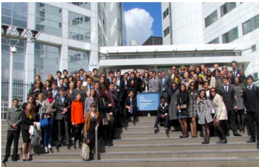
Students in front of the International Criminal Court during the 5th Edition, ICC Trial Competition 2012.

As of 2011, the International Criminal Court formally recognizes the ICLN ICC Trial Competition as the only official ICC moot court competition in the English language.