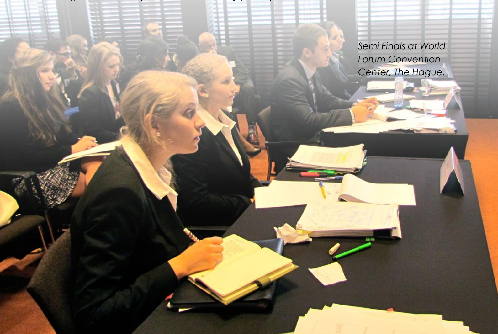
Semi Finals at World Forum Convention Center, The Hague.

The 2012 edition attracted a record number of 26 teams, 150+ participants from 20 different countries from 6 continents. Its organization received the record highest rate of reported satisfaction by participants to date.