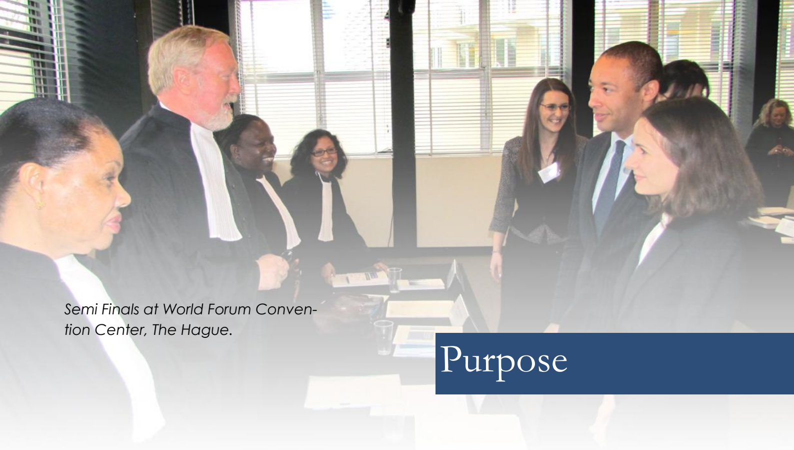
Semi Finals at World Forum Convention Center, The Hague.