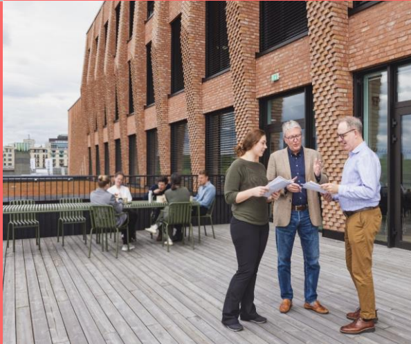
Oslo Science Park