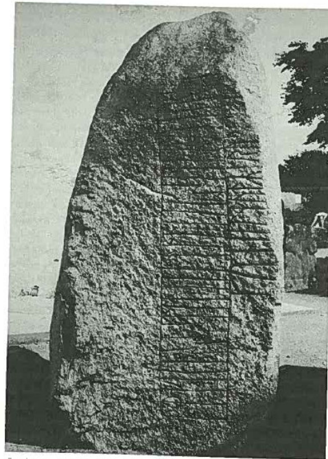
Gørlev-st. Side B. DR. Atlas. 578.

A: þiaupui:risþi:stinþansi:aftuþinkaaur: fuparkhnniastbmlR:niutualkums: B: þmkiiisssttiiiill[:]iaksataru[na]ri[t] kuniarmutRkrub[...]