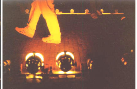
Figure 3. Visitors exploring the CLAVIER and dancing on it in the rain, showing co-located feedback and multiple input loci