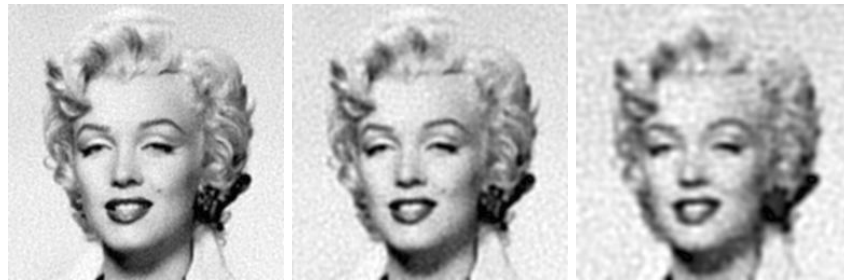
(a) Threshold 30. 93.7% of the DCT-values were neglected (b) Threshold 50. 96.7% of the DCT-values were neglected (c) Threshold 100. 98.5% of the DCT-values were neglected