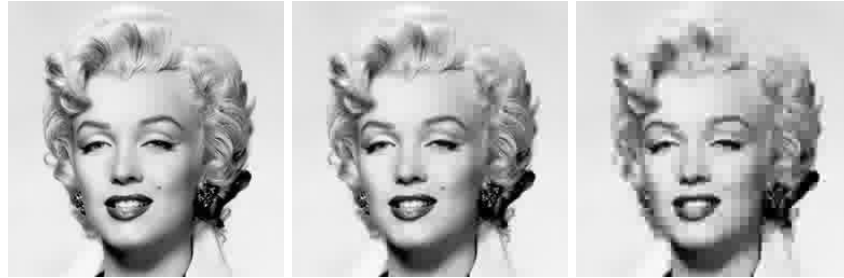
(a) Threshold 30. 93.9% of the DCT-values were neglected (b) Threshold 50. 96.0% of the DCT-values were neglected (c) Threshold 100. 97.6% of the DCT-values were neglected