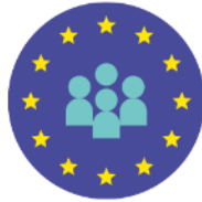
EUROPEAN INTEGRATION BASIC MODULE 1