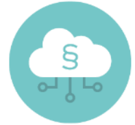
IT-LAW MODULE 6