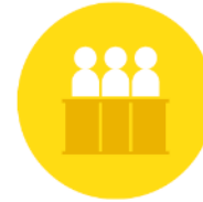
INTERNATIONAL DISPUTE RESOLUTION MODULE 4