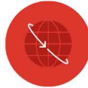
FOREIGN TRADE AND INVESTMENT MODULE 3