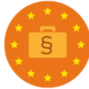
EUROPEAN ECONOMIC LAW MODULE 2